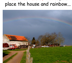
(c) Demonstration of Capture-MLLM's interpretable and interactive aesthetic cropping